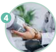
4 People with metabolic symptoms