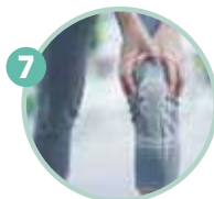
7 People with joint pain