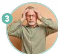
3 The infirm and the elderly