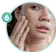
6 Poor skin condition, aging skin