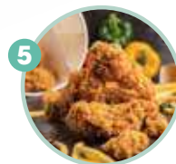
5 People who eat meat and less fruits and vegetables